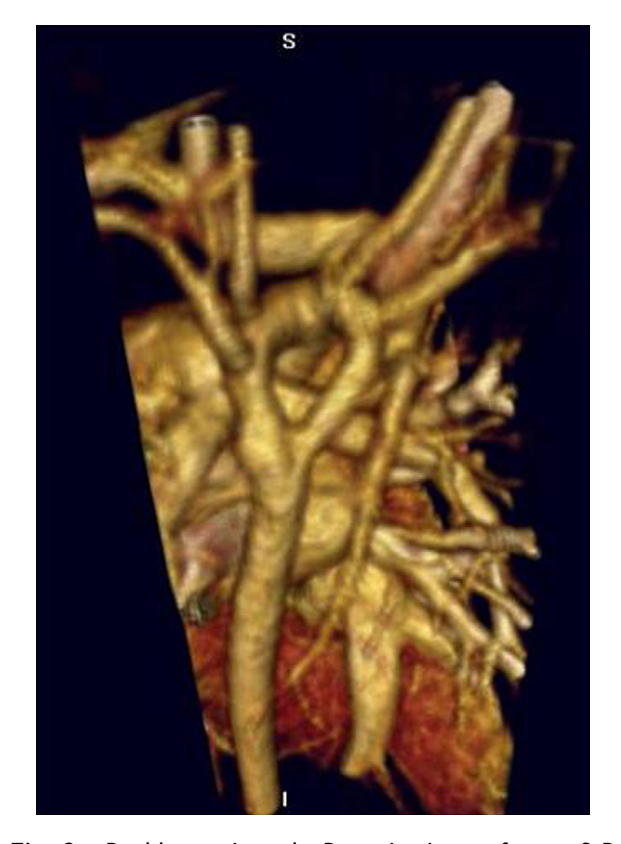
Fig. 3 Double aortic arch. Posterior image from a 3-D volume rendered MR angiogram demonstrating a double aortic arch with the left and right arches joining posteriorly. The left and right arches give rise to the left and right common carotid and subclavian arteries, respectively.

Pre-operative evaluation should also include frontal and lateral chest radiographs [9], barium swallow, echocardiography, and MRI or CT of the chest. The importance of frontal and lateral chest