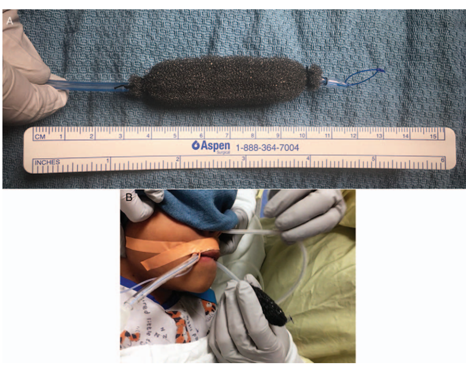
FIGURE 1. A, Picture of esophageal vacuum-assisted closure (EVAC): vacuum-assisted closure (VAC) GranuloFoam sponge rimmed to size and fitted over a Salem Sump before placement into the esophagus. There is a Prolene loop stitch at end to facilitate endoscopic placement and removal. B, After placing the Salem Sump into the nose and pulling out the most, the VAC GranuloFoam is attached to the sump tube, before placement into the esophagus. The sponge has been soaked with water-soluble contrast and coated with water-soluble lubricant.