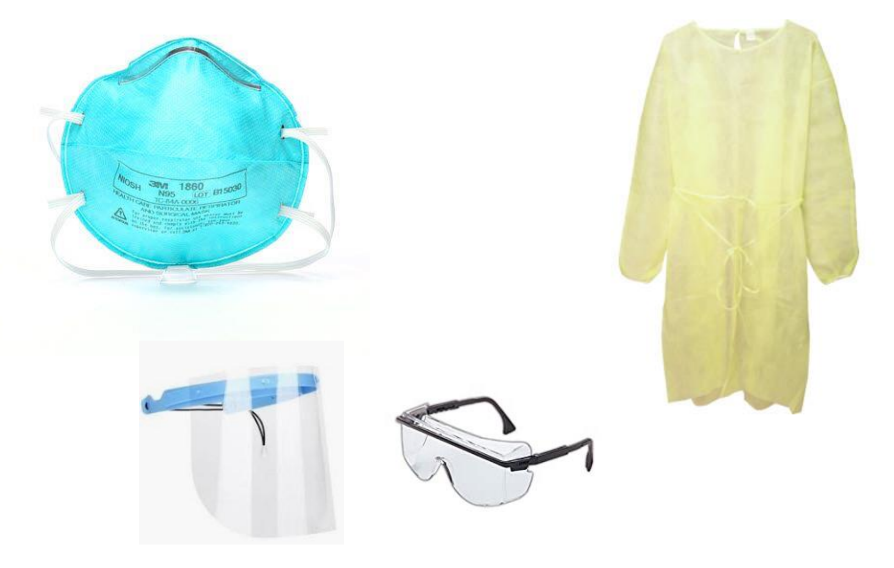
They have to wear a lot of special clothes and masks. This helps them stay healthy while they help me get better.